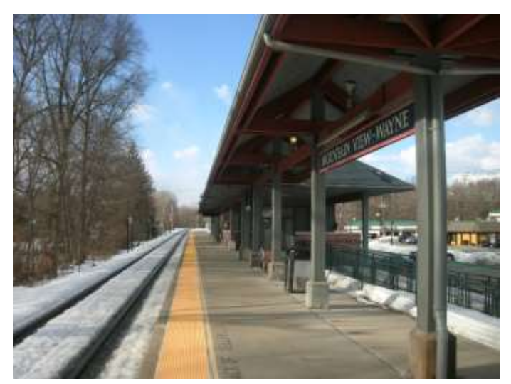
Trail ends at Mountain View train station in Wayne

The bid process will begin once funding is authorized by the New Jersey Department of Transportation. The county has submitted final project plans and specifications required for that authorization to NJ DOT. Formal bidding and construction are expected to take place in 2021.